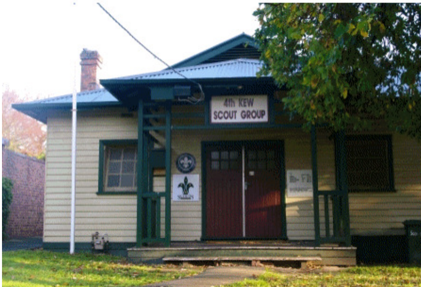
HO326 4th Kew Troop Boy Scouts Association Hall of 1935 City of Boroondara

The 1st Deepdene Scout Hall is one of four pre-World War II scout halls to survive in the City of Boroondara. Design and construction of the 1st Canterbury, 1st Camberwell and 4th Kew scout halls are all characteristic of scout halls built prior to 1930, using simple timber construction and showing the influence of the bungalow styles popular in the interwar period. As the only pre-war scout hall of brick construction in the municipality, the 1st Deepdene is a good example of the growing popularity of scouting in the interwar period, which meant that some troops had the financial means to construct more elaborate buildings, sometimes to the design of an architect.