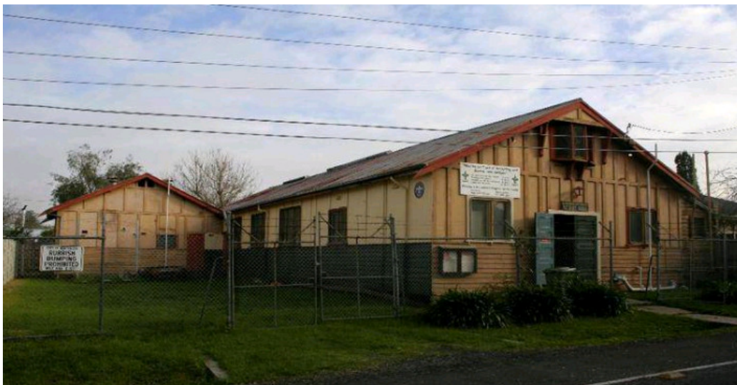
HO362 1st Alphington Boy Scout Hall no. 20 of 1931, Individually Significant place within Alphington East Precinct, City of Yarra