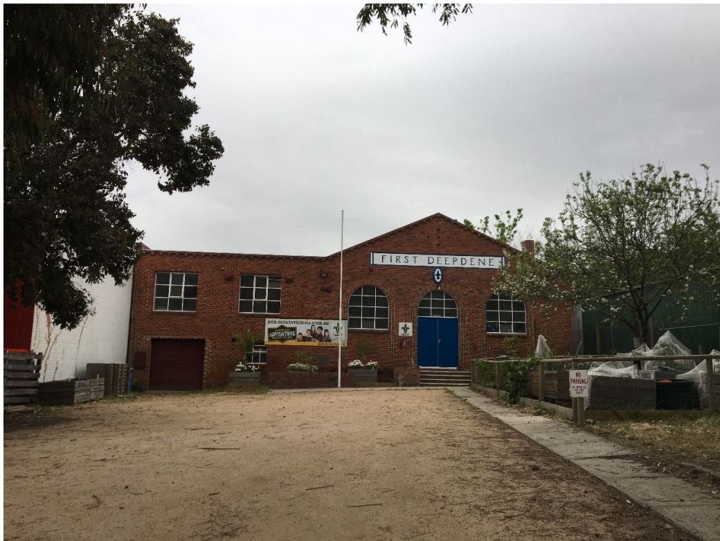
Figure 1. View of 1st Deepdene Scout Hall at 32 Whitehorse Road, Deepdene.