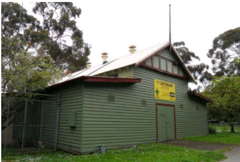
HO691 1st Canterbury Troop Boy Scouts Association Hall of 1924 City of Boroondara

The 1st Deepdene Scout Hall, built in 1932, is among the earliest surviving purpose-built scout halls within the City of Boroondara. The three earliest scout halls to survive in the municipality are the 1st Canterbury of 1924 (25 Shierlaw Avenue, Canterbury, HO691) the 1st Camberwell of 1925 (12 Palmerston Street, Contributory in HO159), and the 4th Kew of 1935 (13 Glass Street, Kew East). All three are still occupied by the scouts. The design of each of these three examples, using timber construction, is characteristic of scout halls built prior to 1930.