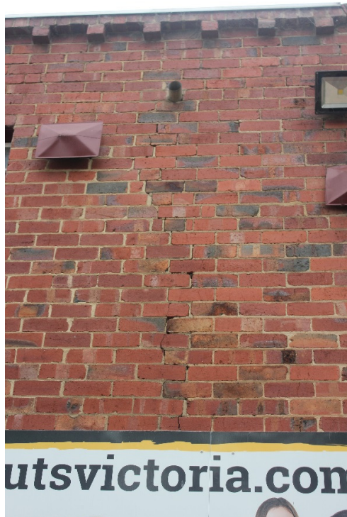
Figure 5. Evidence of the original corbelled eave that was infilled by the 1952 extension at the eastern end of the original scout hall building.