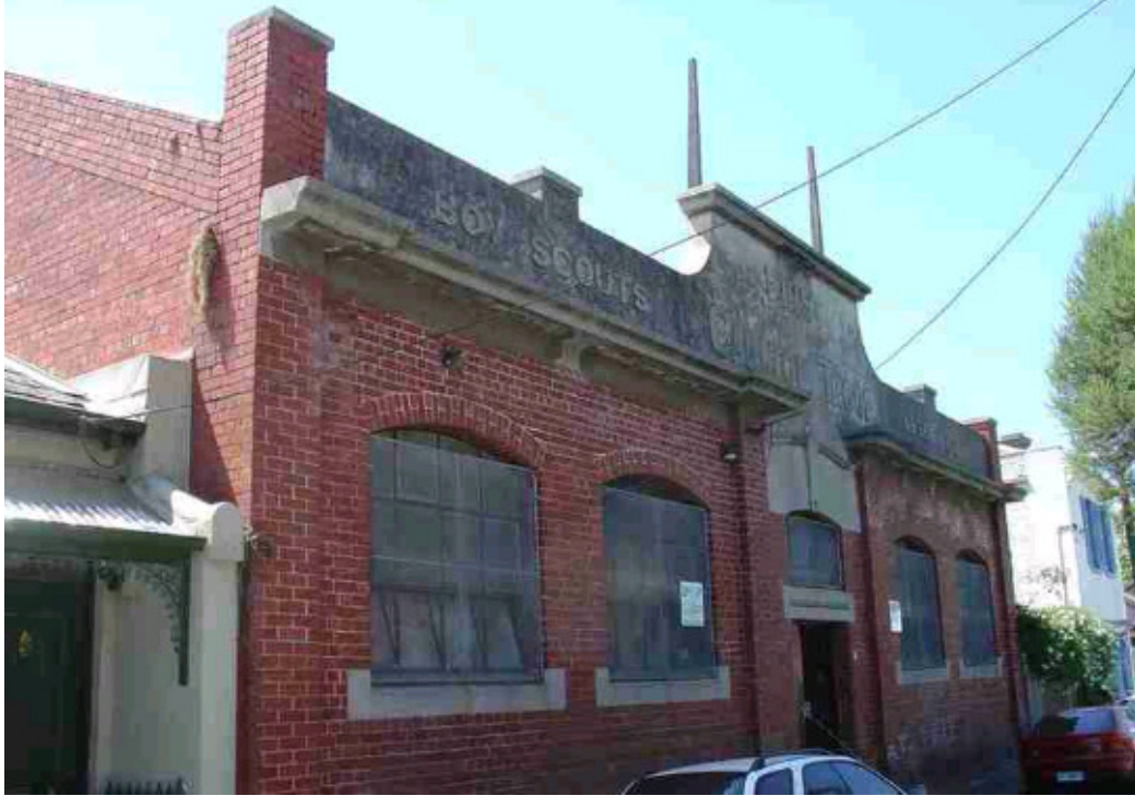
HO326 1st Carlton Troop Boy Scouts Association Hall of 1931 City of Yarra

The 1st Deepdene Scout Hall, built in 1932, is among the earliest surviving purpose-built scout halls within the City of Boroondara. The three earliest scout halls to survive in the municipality are the 1st Canterbury of 1924 (25 Shierlaw Avenue, Canterbury, HO691) the 1st Camberwell of 1925 (12 Palmerston Street, Contributory in HO159), and the 4th Kew of 1935 (13 Glass Street, Kew East). All three are still occupied by the scouts. The design of each of these three examples, using timber construction, is characteristic of scout halls built prior to 1930.