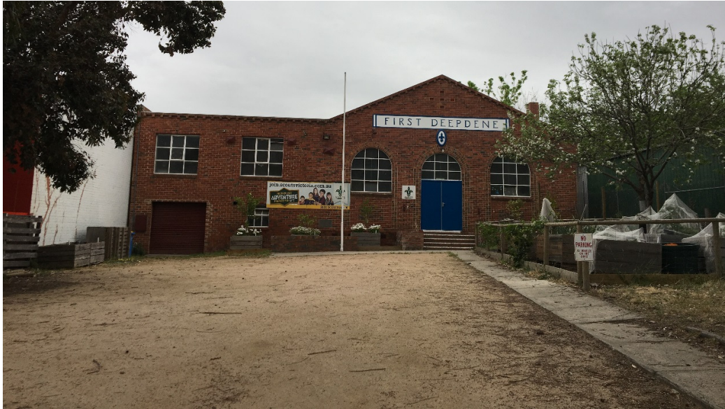
Figure 4. Large front setback and principal frontage of the scout hall.

Whitehorse Road, it is situated just to the east of the Outer Circle Trail, along the former Outer Circle railway line that once serviced much of the modern City of Boroondara. The Scout Hall is sited on a large parcel sloping gently to the east, with a generous setback comprising almost two-thirds the depth of the entire allotment. A low cyclone fence, erected in the post-war period, delineates the property's front (northern) boundary.