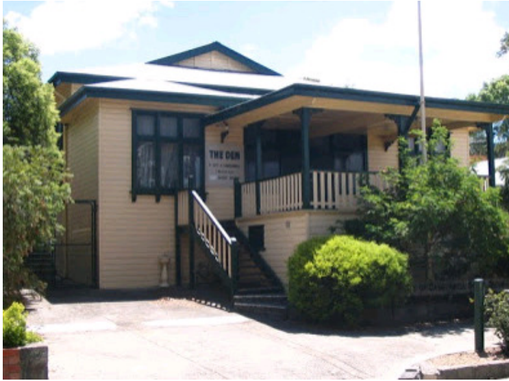
HO159 1st Camberwell Troop Boy Scouts Association Hall of 1925 City of Boroondara