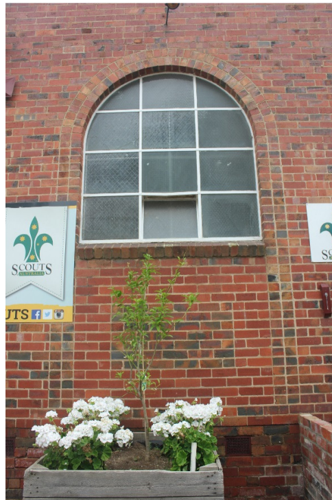
Figure 6. Red-blue clinker brick detailing provides subtle visual interest to the principal façade.

The arrangement of the principal façade has been rendered asymmetrical by the 1952 extension, consisting of a single-storey gabled bay to the west and a rectangular bay to the east. The gable end is supported on a corbelled eave at the west end of this elevation, and the irregular stretcher bond evidences where the brickwork has been infilled by the later extension on the east side. Subtle visual interest is provided to this facade with the use of red-blue brick panelling, brick header detailing to the arched window and door openings, and ornamental dentil course brickwork to the eaves suggesting a Romanesque corbel table; these details were also carried to the 1952 extension. Five terracotta vents are arranged in a cross-shaped configuration near the apex of the gable end. Beneath this sits a painted cement-rendered panel with the words 'First Deepdene' inscribed, and a plaque with the fleur-de-lis motif, the symbol of Scouting.