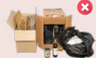
Domestic waste and recyclables