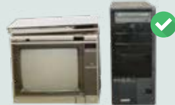
Computers, monitors, TVs and DVD players