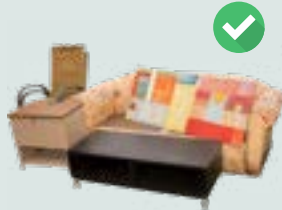
Household furniture, toys, plant pots, crockery

Hard waste ends up in landfill so please consider if you can sell, donate or repurpose items before you place these out for collection.