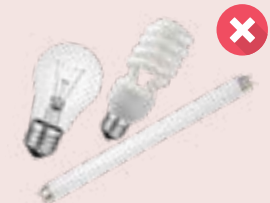
Light bulbs and fluorescent tubes, unwrapped or broken glass