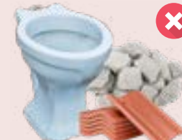
Bricks, concrete, ceramic, tiles and rubble