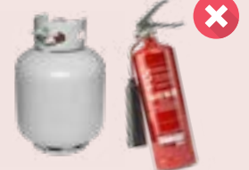
Gas bottles and fire extinguishers