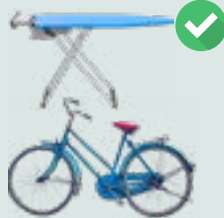
Scrap metal – no longer than 1.5 metres