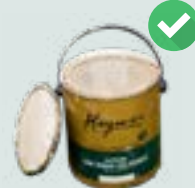
Empty paint tins with lids removed