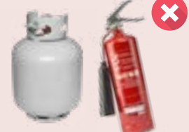
Gas bottles and fire extinguishers