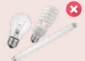
Light bulbs and fluorescent tubes, unwrapped or broken glass