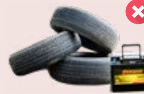
Tyres and batteries