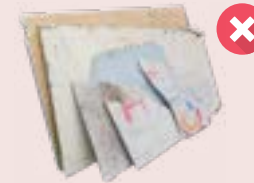
Plaster board, cement sheeting, asbestos products