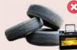
Tyres and batteries