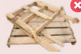
Fences, pallets, renovating or building materials