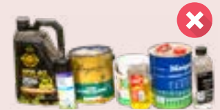
Paint, oil, liquid waste, chemicals and flammable fluids