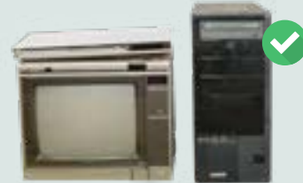
Computers, monitors, TVs and DVD players