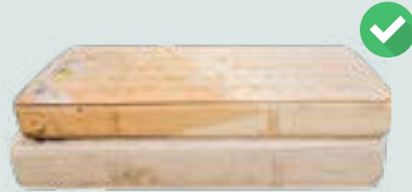
Any size (up to two items per collection)