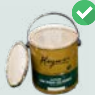
Empty paint tins with lids removed