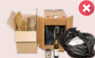
Domestic waste and recyclables