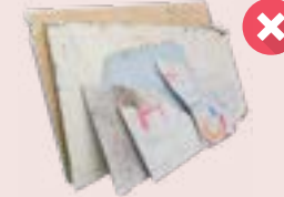
Plaster board, cement sheeting, asbestos products