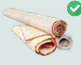
Carpet – up to three rolls, no longer than 1.5 metres