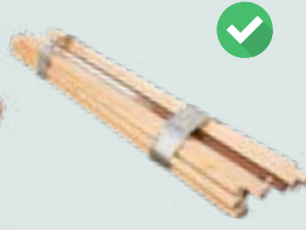
Timber – 12 pieces neatly stacked and no longer than 1.5 metres