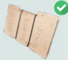
Mirror and glass items securely wrapped in cardboard marked 'glass'