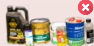
Paint, oil, liquid waste, chemicals and flammable fluids