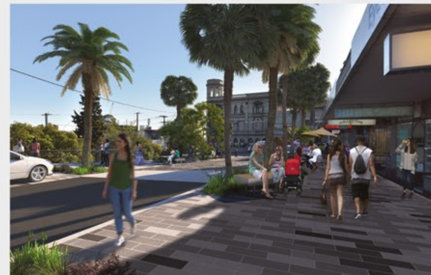
View to Burke Road

Note: Artist's impression, final material selection and planting species subject to budget.