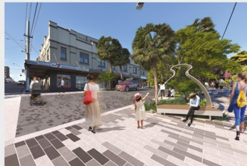
View from Burke Road

Note: Artist's impression, final material selection and planting species subject to budget.