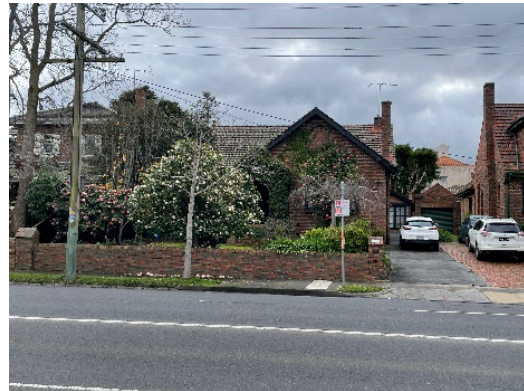
Figure 2. 129 High Street, Glen Iris