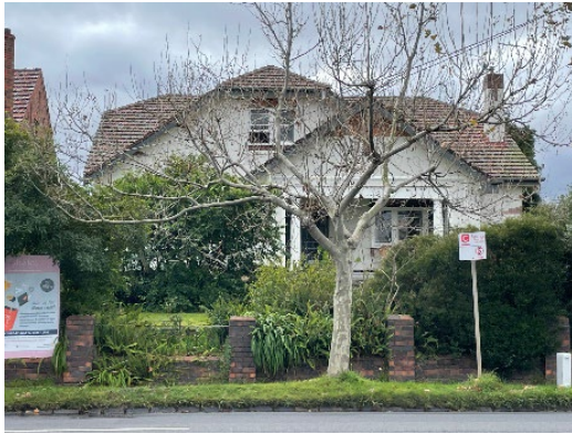
Figure 7. 139 High Street, Glen Iris