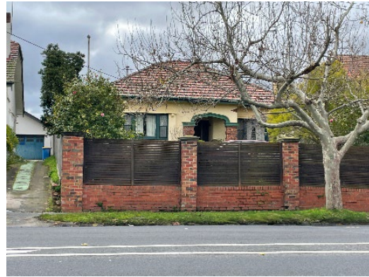
Figure 8. 141 High Street, Glen Iris