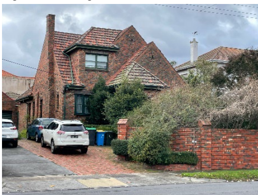
Figure 3. 131 High Street, Glen Iris