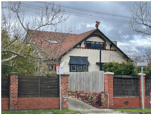
Figure 9. 152 Summerhill Road, Glen Iris