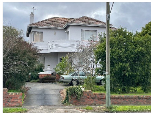
Figure 4. 133 High Street, Glen Iris