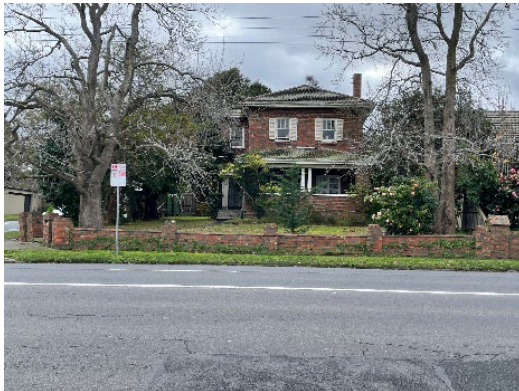
Figure 1. 127 High Street, Glen Iris