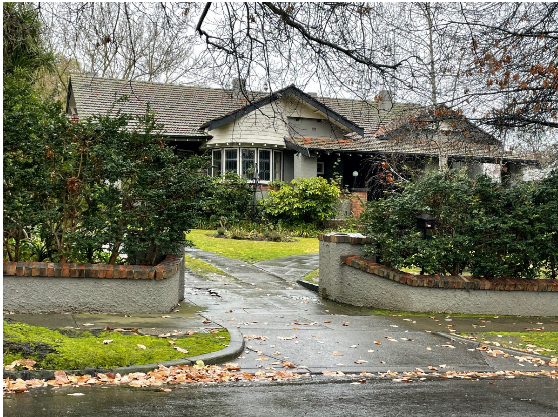
Figure 1. 7 Fuller Avenue, Glen Iris (July 2022)