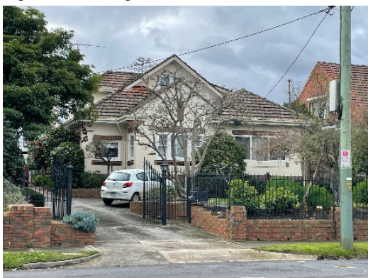
Figure 5. 135 High Street, Glen Iris