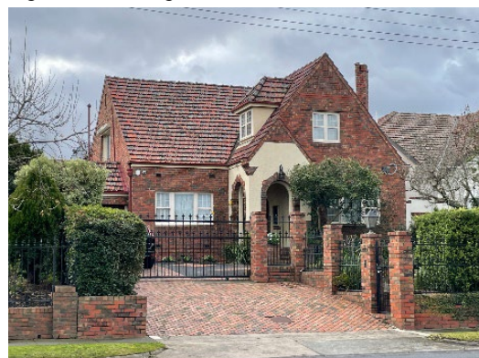
Figure 6. 137 High Street, Glen Iris