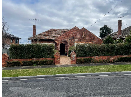
Figures 1-8: Examples of residences included in the precinct (L-R, starting at top) 148 High Street, Ashburton and 9, 12, 17, 21, 22, 23 & 24 Tower Hill Road, Glen Iris & (GJM Heritage, July 2022).