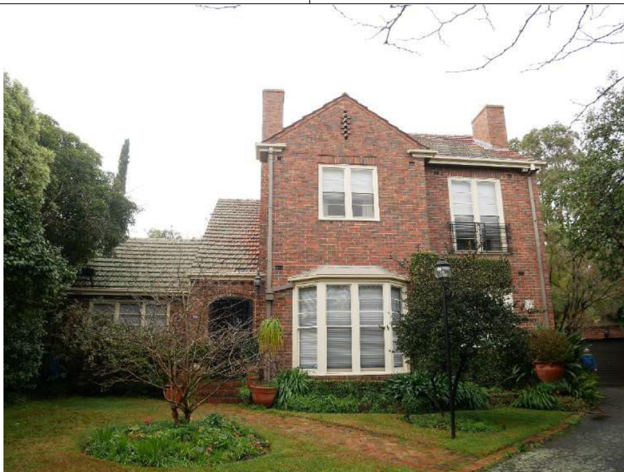
Figure 1. 33 Fuller Avenue, Glen Iris (July 2022)

33 Fuller Avenue, Glen Iris, constructed in 1936/37 to a design by architects Forsyth and Dyson.