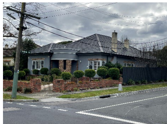
Figures 1-6. Examples of residences included in the precinct (R-L, starting at top) 28, 42, 44, 46, 58 and 60 Dent Street, Glen Iris (GJM Heritage, July 2022).

This is an incorporated document in the Boroondara Planning Scheme pursuant to Section 6(2)(j) of the Planning and Environment Act 1987 .