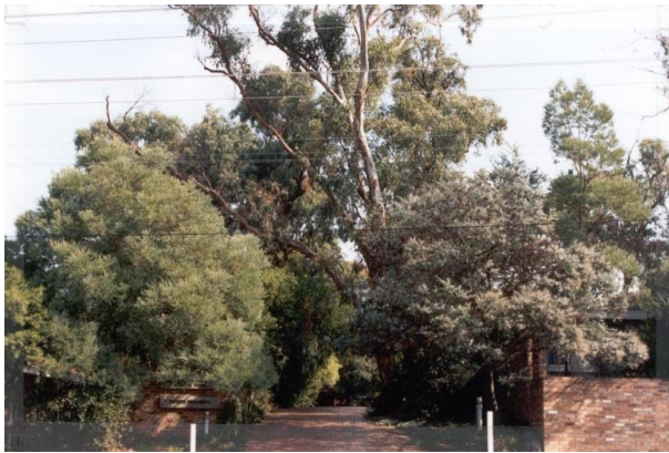
Figure 4 Winter Park, 137–141 High Street Doncaster (H1345, HO83) constructed in 1970 to 1974 by Merchant Builders Pty Ltd.

The following individually significant places are comparable to the subject place being designed by Graeme Gunn and built by Merchant Builders.