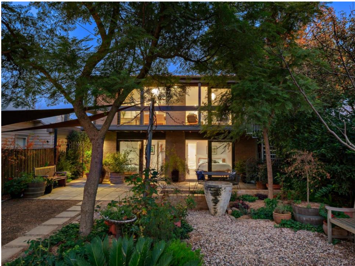
Figure 1 7 Burton Avenue, Hawthorn.