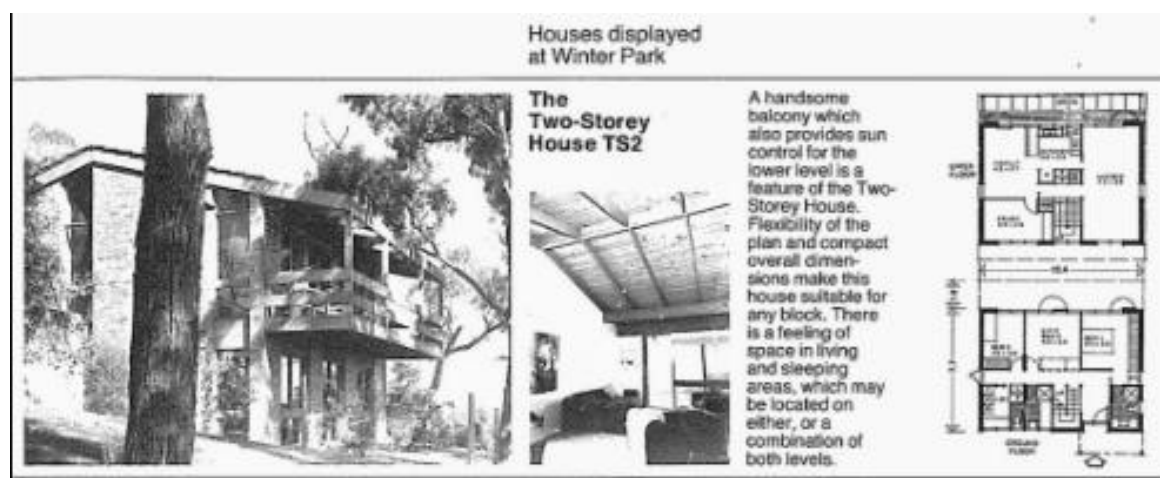
Figure 3 Original brochure showing houses available at Winter Park. Extract shown shows the Two-Storey House which was the design used at 7 Burton Avenue, Hawthorn.

The Riachs remained at the property until 1988. The property changed hands several times over the next two decades. In 2012 its then owners' commissioned Gunn to update the interior to their needs. The property last changed hands in 2020.