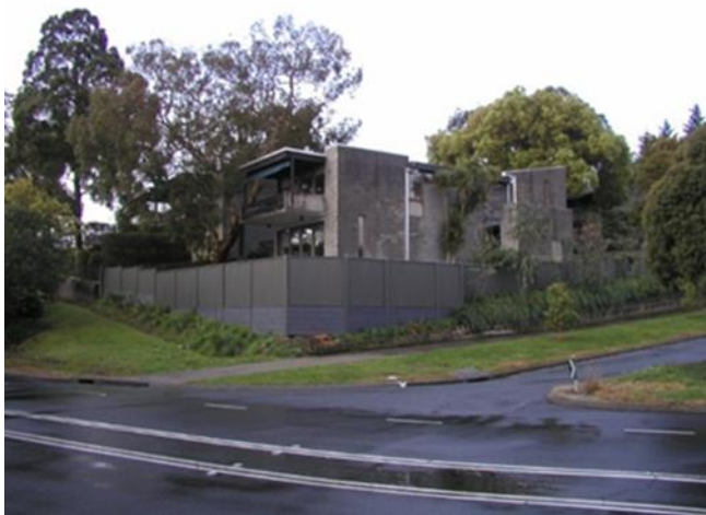
Figure 5 'Townhouses', 76 Molesworth Street, Kew (HO325), built in 1969 to a design by architect Graeme Gunn.

137–149 High Street, Doncaster is a cluster of 20 detached houses to a design by Merchant Builders led by Graeme Gunn, Rob White and Ellis Stones in stages between 1970 and 1974. 'Winter Park', 137–141 High Street, Doncaster, was constructed in two stages between 1970–1974 by notable building firm Merchant Builders. The project of twenty detached houses with individual private courtyards emphasised the importance of environmentally sensitive construction which integrated dwellings within both the natural landscape and communal open space. The landscape planting retained its large eucalypt trees and also incorporated stone retaining walls, boulders and native plantings. A pioneer of cluster title subdivision, 'Winter Park' won an RIAA Award Citation in 1975.