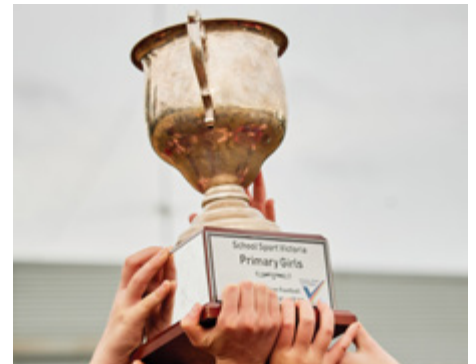
Canterbury Primary School's girls' football team's trophy.