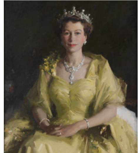
Her Majesty Queen Elizabeth The Second 1954: William Dargie.