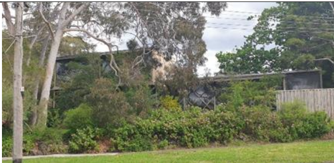
Figure 5 'Gillson House', 43 Kireep Road, Balwyn, designed by Robin Boyd in 1952 (HO177).

'Bunbury House', 300 Balwyn Road, Balwyn North is of local historical, architectural, aesthetic and social significance. It represents a significantly early and intact example of modernist architecture by prominent Australian architect, theorist, author and critic Robin Boyd. 'Bunbury house' displays clear associations in its design and detailing with the designs of Robin Boyd that were developed as part of the Small Homes Service, an initiative that sought to provide cost effective, architecturally designed homes to a wider audience. 'Bunbury house' incorporates design elements that are recognisable and important in Boyd's design work, including the design of efficient floor plans, floor to ceiling glazing, projecting eaves and suspended sun shading devices constructed from timber slats.