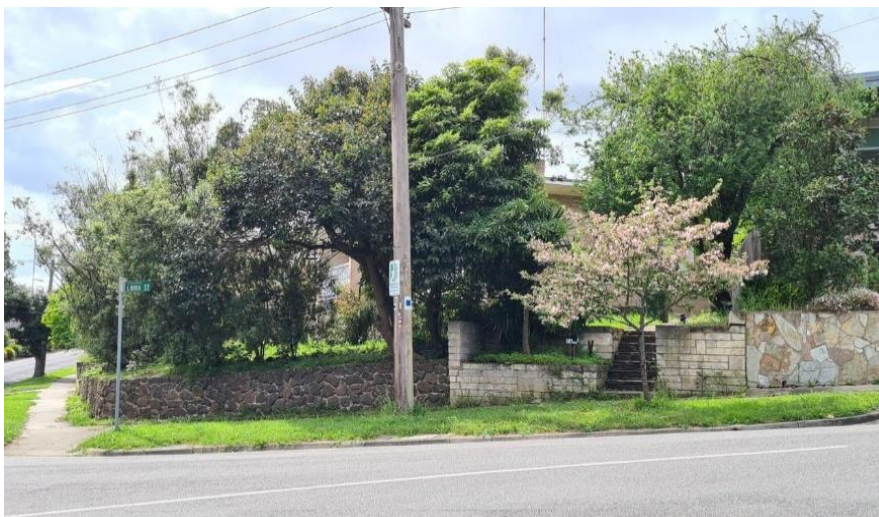
Figure 2 Presentation to Libra Street.