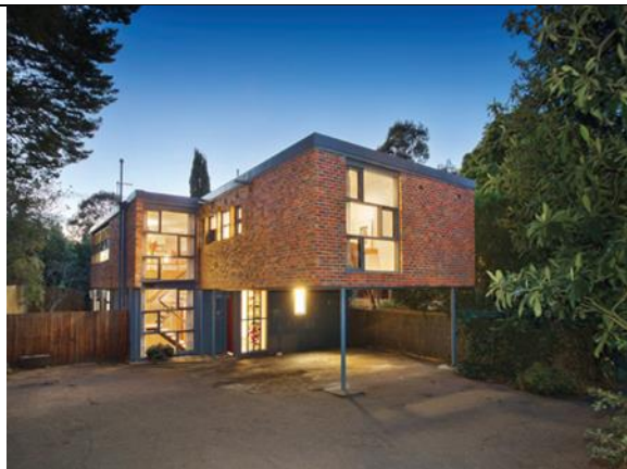
Figure 8 'former Hirsch House and Office' at 118 Glen Iris Road, Glen Iris, designed by Grigore Hirsch (CONARG Architects) in 1954-55 (HO897)

domestic design which have now become common.