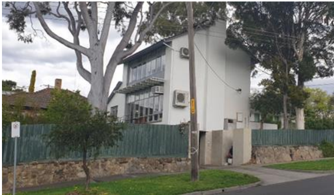
Figure 4 'Bunbury house', 300 Balwyn Road, Balwyn North, designed by Robin Boyd in 1949 (HO616).

In spite of the dominance of houses built in the years following the Second World War, Heritage Overlay coverage of postwar houses in Balwyn and Balwyn North is limited. The house at 24 Orion Street, Balwyn North, can be compared broadly to a number of contemporaneous houses in the locality that exhibit a similar use of volumetric massing, flat or low-pitched roofs, and full-height glazing. These include: