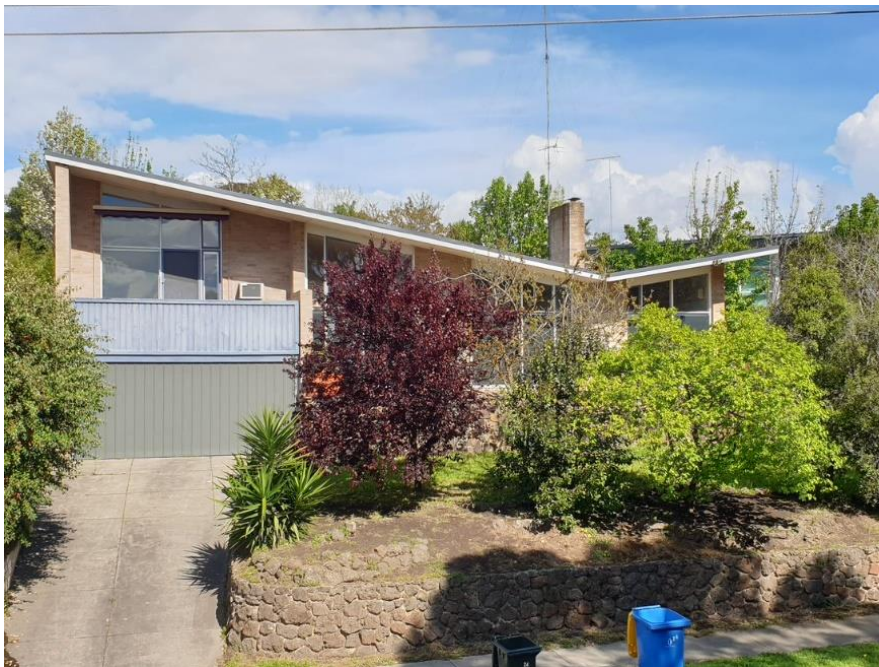
Figure 1 Principal façade, facing Orion Street to the north.