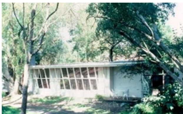
Figure 7 'Robin Boyd House I', 664-666 Riversdale Road, Camberwell, designed by Robin Boyd in 1947 (VHR H0879; HO116).

There are also several postwar houses on the Heritage Overlay in the broader Boroondara context that are comparable to 24 Orion Street Balwyn North. Examples include: