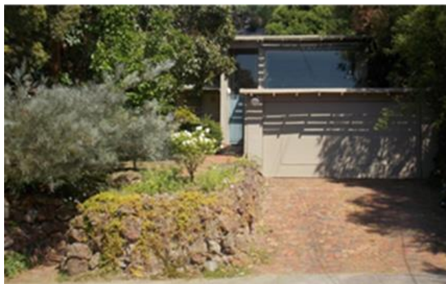
Figure 6 12-14 Tannock Street, Balwyn North, designed by Robin Boyd in 1948-49 with alterations by Boyd in 1959 and 1971 (HO928).

visual extreme, in the design of the writer's study.