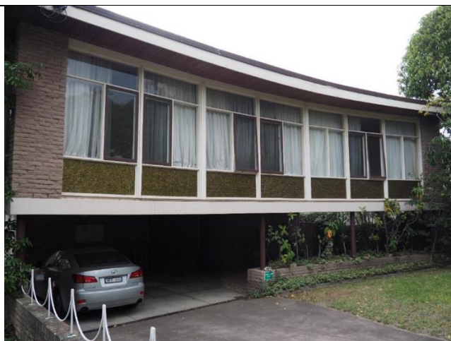
Figure 12 'Cukierman Residence', 29 Leura Grove, Hawthorn East, designed by Hayden & Associates (attributed to Anthony Hayden) in 1966 (HO857).

'Cukierman Residence', 29 Leura Grove, Hawthorn is of local historical, architectural, aesthetic and technical significance to the City of Boroondara. The residence derives its aesthetic appeal from its unusual and striking architectural composition with references to the International Style. Interest is created through the floating curved massed form fronting the street and subtle but evocative detailing of materials. The horizontal articulation of the window sets with their green mosaic tiled spandrel panels is applied with effect. Slender circular columns support the raised form, creating an open undercroft, and the use of textured cream brick is continued in the landscaping elements such as the low walls and planters.