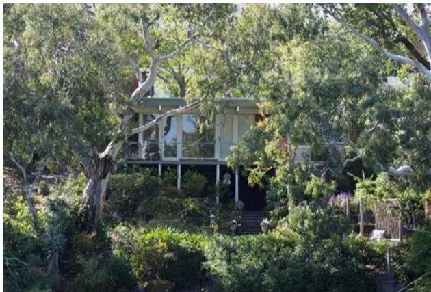
Figure 11 'Dickie House', 6 Fairview Street, Hawthorn, c.1961-64 (HO784).

'Dickie House', 6 Fairview Street, Hawthorn is of local historical, architectural and aesthetic significance. The house is representative of the post-war design ethos, sense of optimism and architectural modernisation pioneered by Robin Boyd and others. The high-quality house-design features honesty of structure and material, clean lines, deep eaves and an overall sense of innovation in design. The integration of the house with the landscape, with its 'floating' appearance over the banks of the Yarra is characteristic of Modernist integration of architecture with natural context.