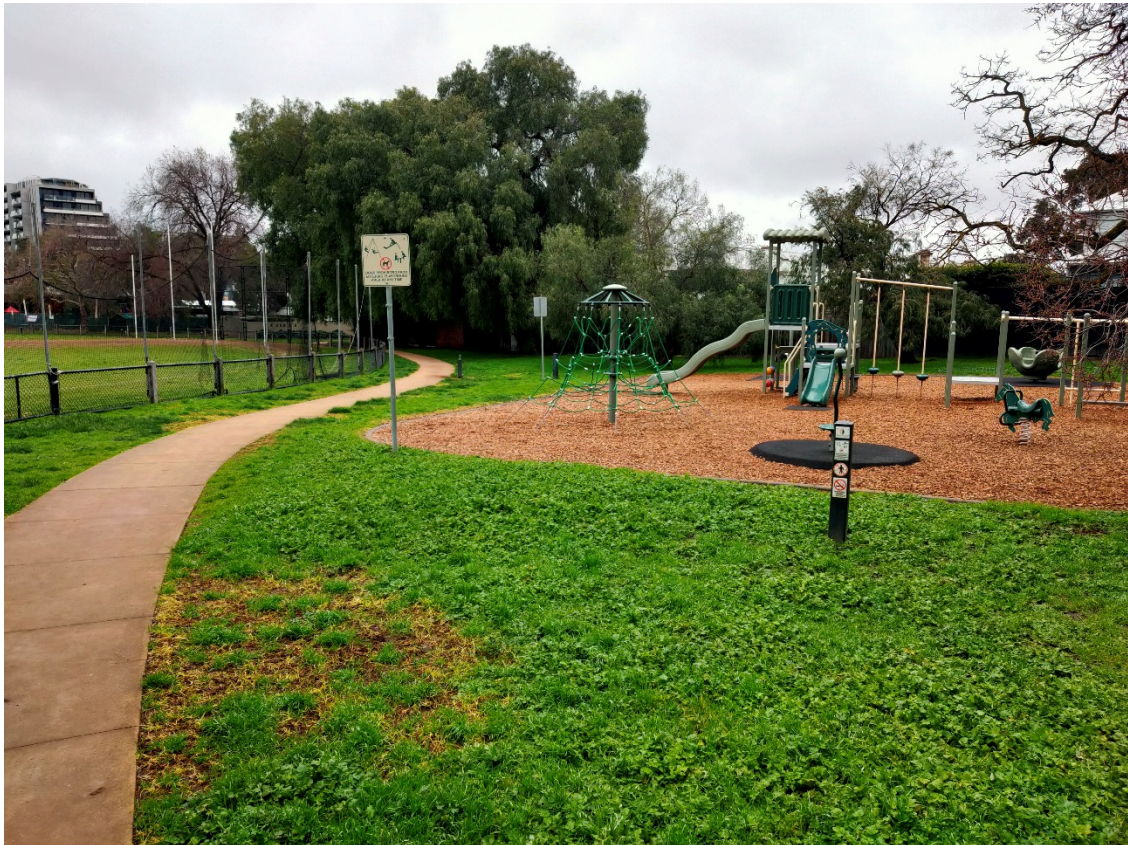
Figure 6 - Council signage informing that dogs are prohibited within the playground.