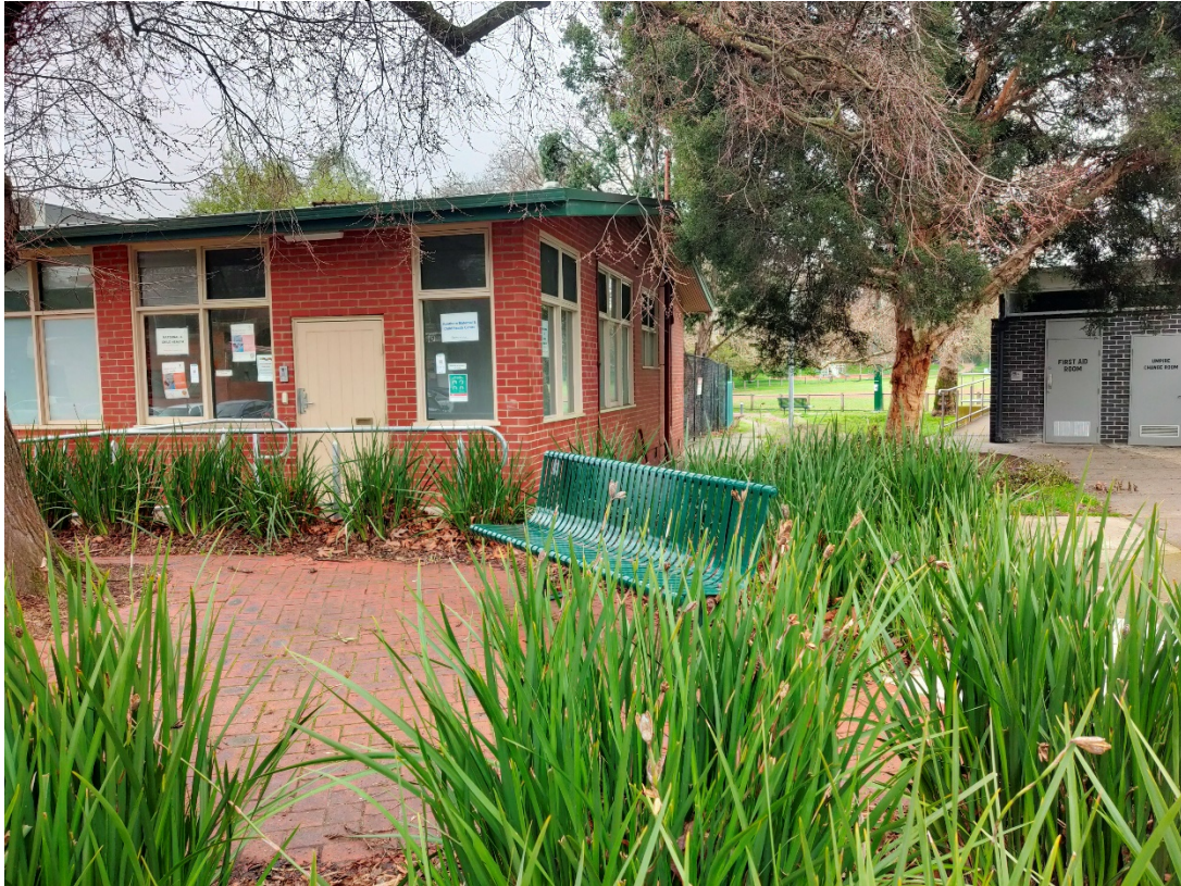
Figure 3 - Front view of the Auburn Maternal & Child Health Centre from the Victoria Road car park.

The Auburn Kindergarten & Child Care Centre regularly use Victoria Road Reserve for play, discovery, events, social gatherings and as their emergency assembly point for approximately 60 kindergarten students (ages three to six).