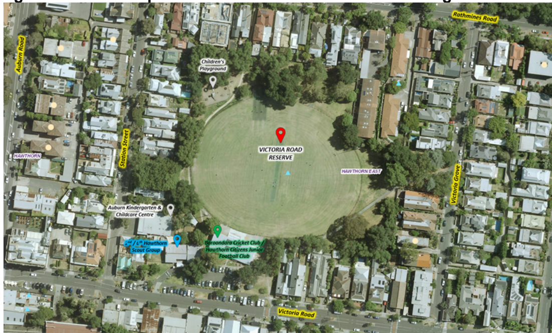
Figure 1 - Aerial Map: Victoria Road Reserve & surrounding stakeholders

Victoria Road Reserve is not listed on Council's Dog Control Order no. 1, meaning it is a dog on-lead reserve. The Dog Control Order no. 1 also states dogs are prohibited within the immediate perimeter of any playground, at all times, and must further be on a cord, chain or leash if within ten (10) metres of the perimeter of a playground in a Designated Reserve at all times.