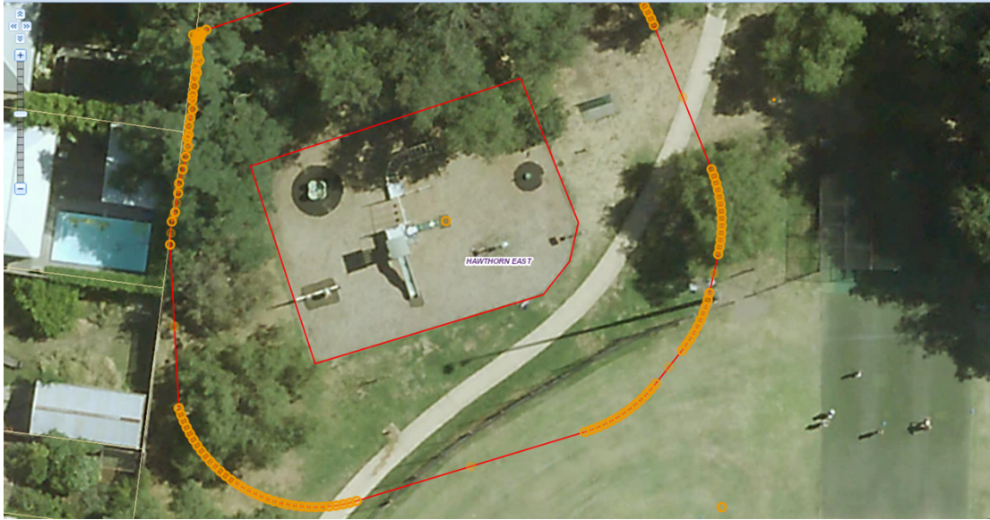
Figure 4 - Playground at Victoria Road Reserve with a 10-metre buffer from the perimeter and intersecting over the sporting oval.

The location of the playground or the sporting oval will not be altered in the proposed upgrade occurring in January 2023. A meshed fence with several openings will be provided in the improvement works. None of the openings will occur within the area encroaching the 10-metre buffer of the playground.