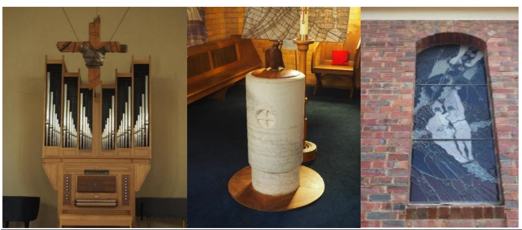
Pipe organ designed by Knud Smenge