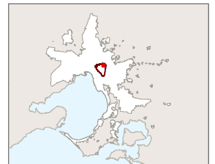
Part of Planning Scheme Map 4HO