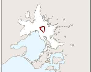
Part of Planning Scheme Map 6HO