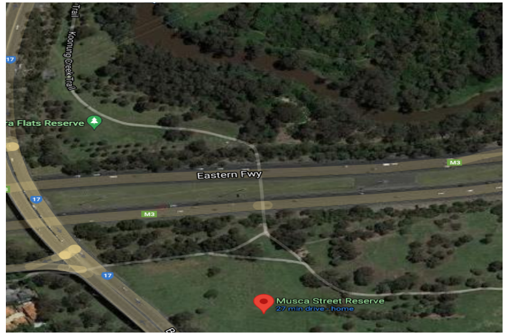
Figure 2 Koonung intersecting bike paths