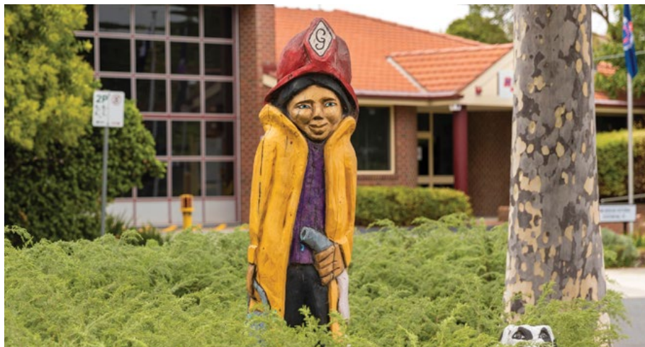
An Angie Polglaze sculpture on Doncaster Road.