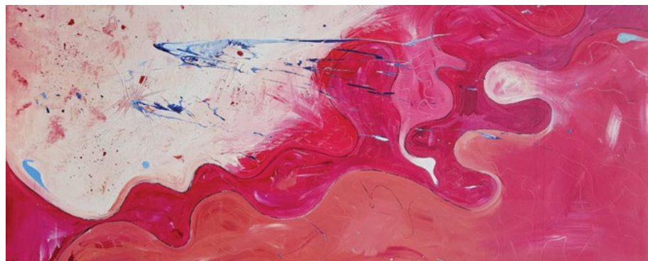
Image: Donald Bate, Freedom Flow , 2017, acrylic on stretched canvas, 203 x 99 cm.

Applications open on Monday 9 May and close on Sunday 19 June.