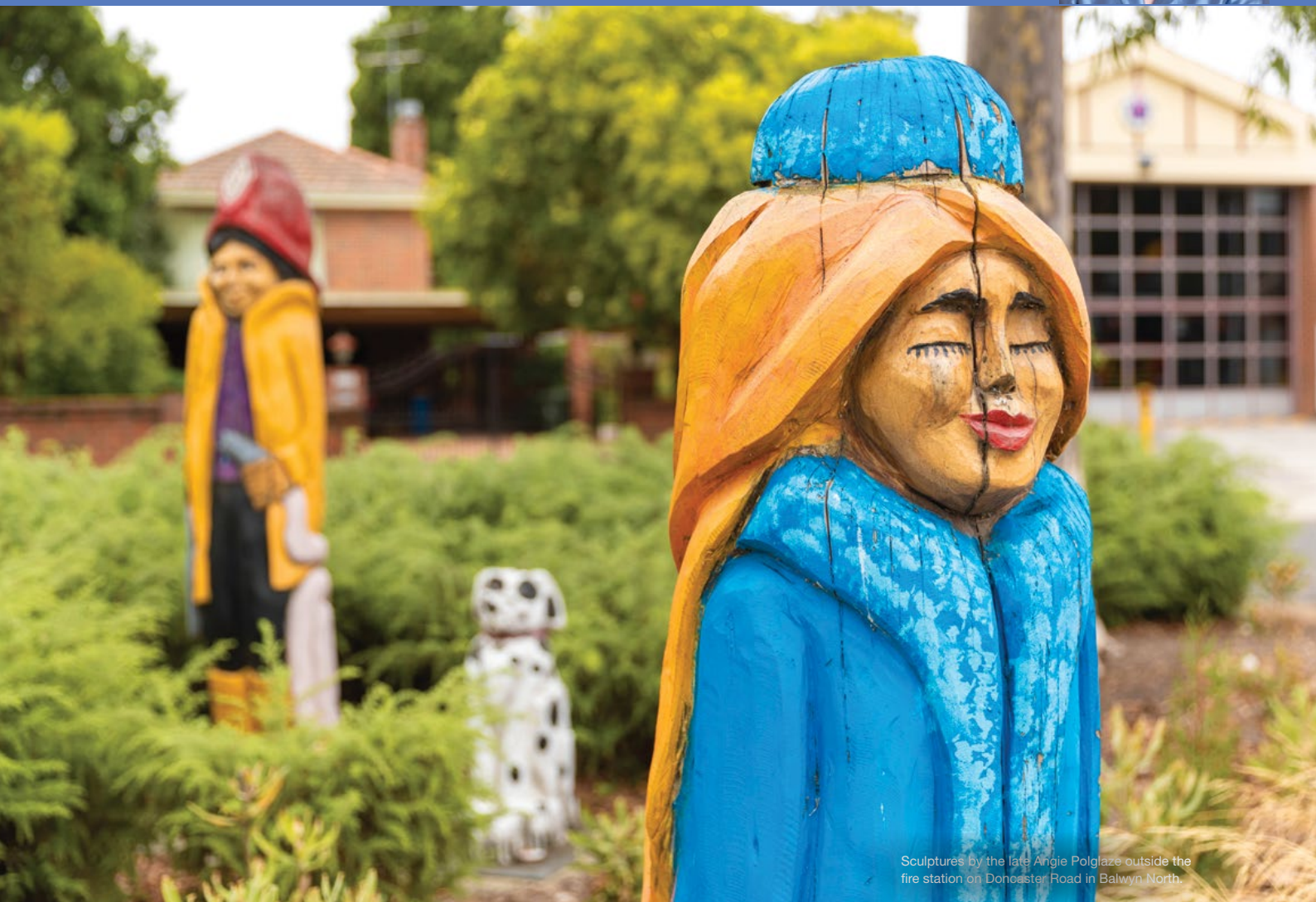
Sculptures by the late Angie Polglaze outside the fire station on Doncaster Road in Balwyn North.