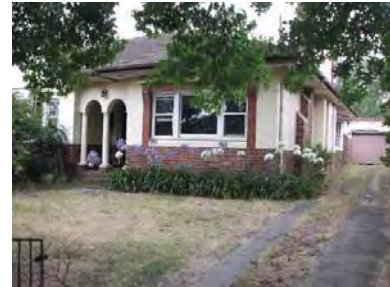
Maisonette at No 23a