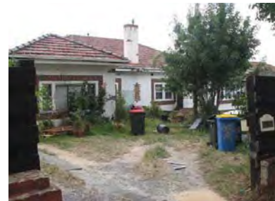
Maisonette pair at Nos 30-30a