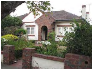
Maisonette at No 27a