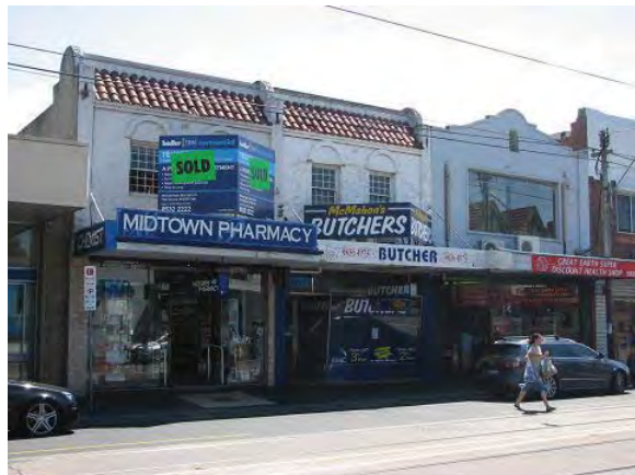
Various early/mid-1930s shops on north side (No 397-399, 401)