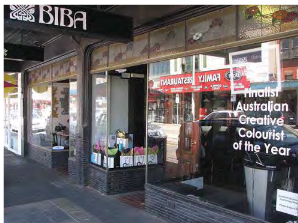
1930s shop-front (No 369) retaining original features