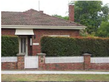
Maisonette at No 19 (side entry)