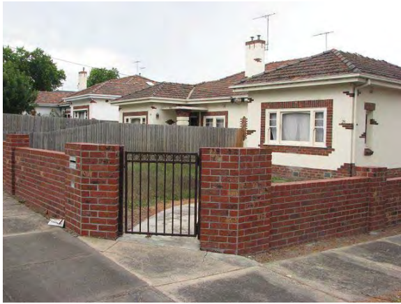
Street scape: southern side of Maud Street, looking east