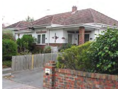
Maisonette at No 21a