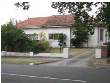
Maisonette pair at Nos 31-31a