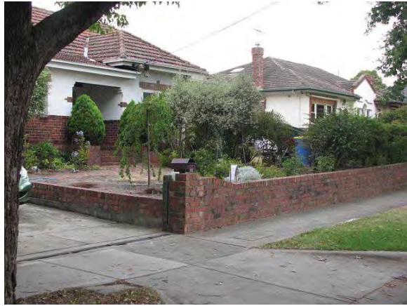
Streetscape: northern side of Maud Street, looking east