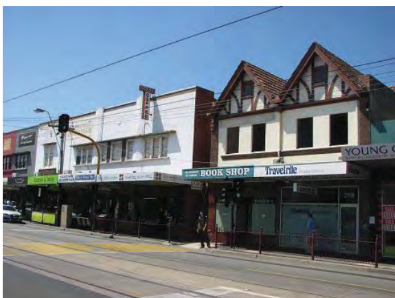
Moderne shops on south side; note roof-mounted signage