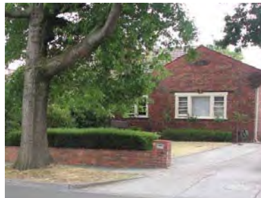
Maisonette at No 29a