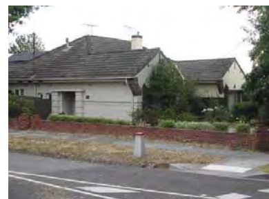
Maisonette pair at Nos 34-34a