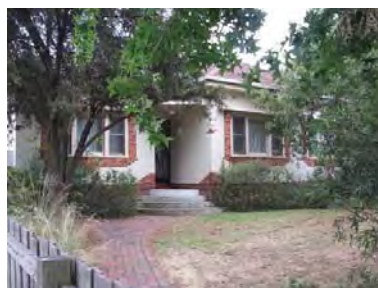
John Brack's former residence at No 33