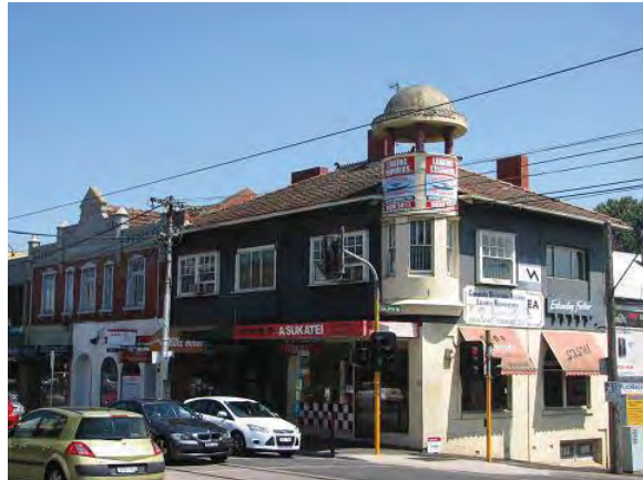
Early (pre-1920) corner shops on north side (Nos 349, 351-353)