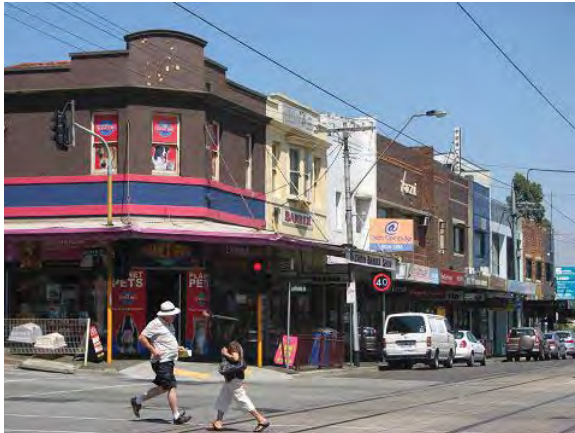
Early (pre-1920) corner shop on south side (Nos 234-236)