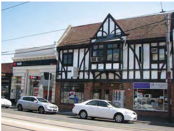
Branch bank (No 359) and Tudor Revival pair (No 361-363)