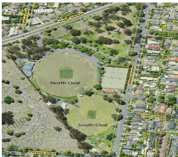
Figure 1 Victoria Park, Kew

Victoria Park is a sporting reserve located at 490 High Street, Kew. It consists of two sporting ovals (North and South) each with an adjacent pavilion utilised by multiple sporting clubs including the Kew Cricket Club, Kew Football Club and Kew Junior Football Club. The Kew Tennis Club and Kew Croquet Club are also located at Victoria Park but have separate facilities to those adjacent to the two sporting ovals as shown in Figure 1.