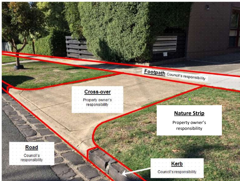
Figure 1: Maintenance Responsibilities for Urban Roadside