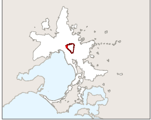
Part of Planning Scheme Map 6HO