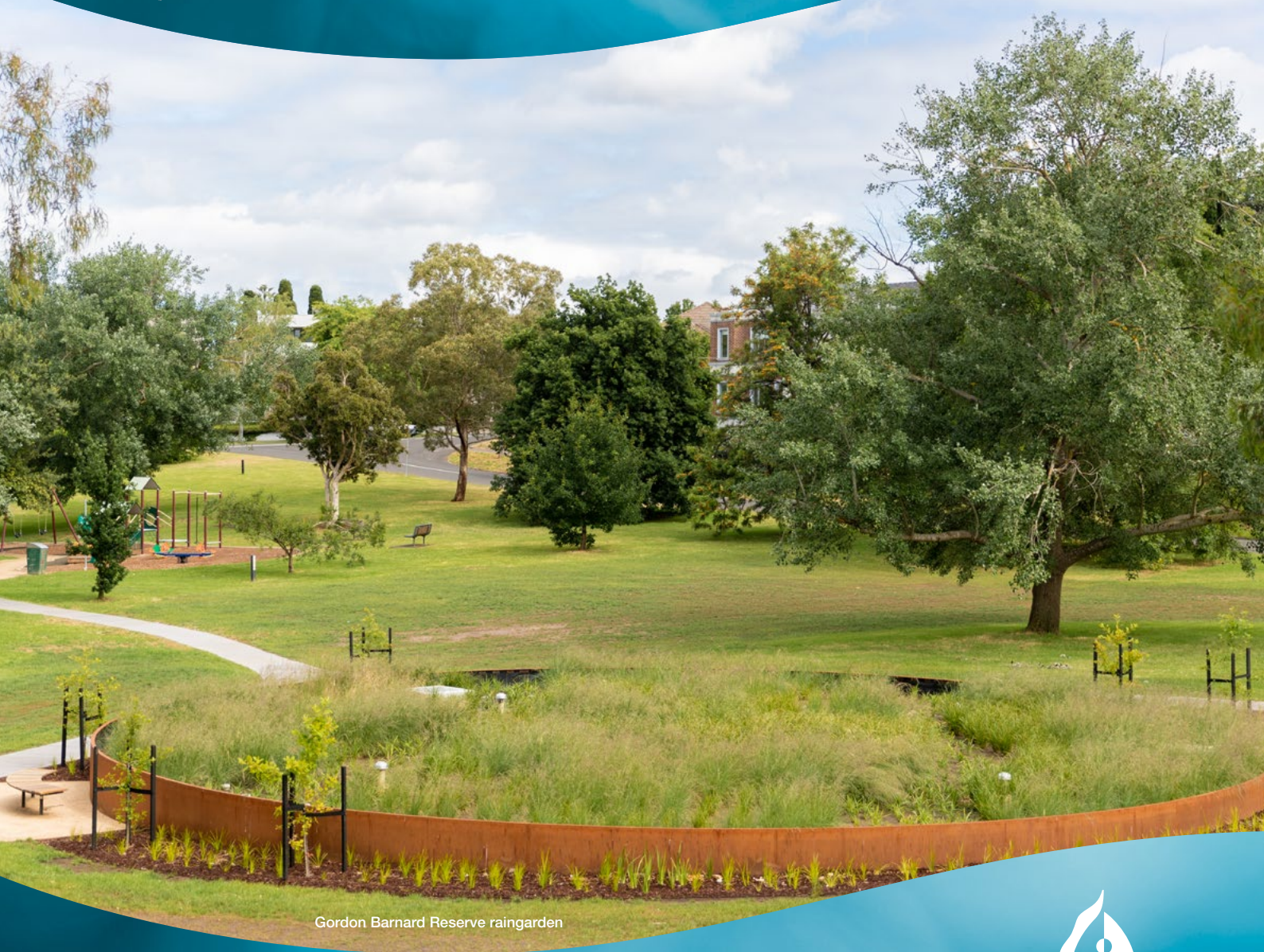
Gordon Barnard Reserve raingarden