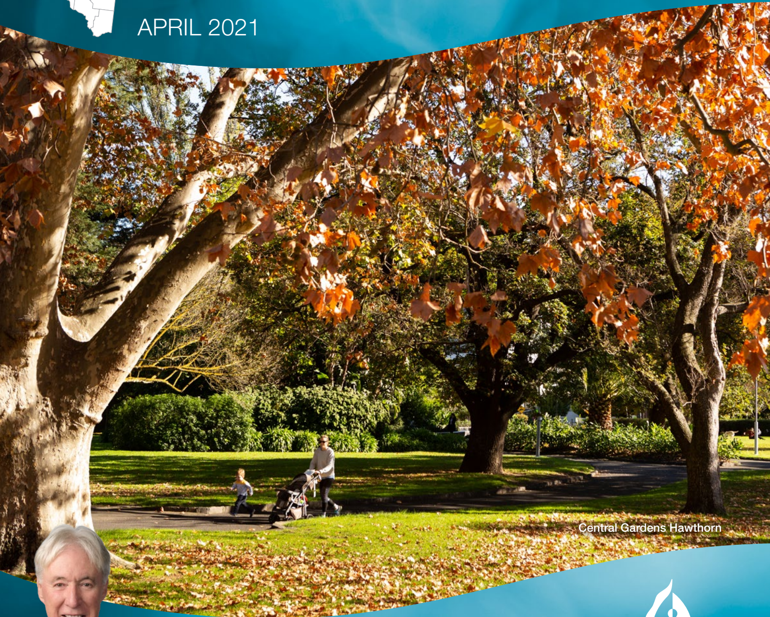
Central Gardens Hawthorn