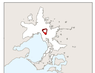
Part of Planning Scheme Map 16HO

Disclaimer This publication may be of assistance to you but the State of Victoria and its employees do not guarantee that the publication is without flaw of any kind or is wholly appropriate for your particular purposes and therefore disclaims all liability for any error, loss or other consequence which may arise from you relying on any information in this publication.