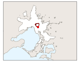
Part of Planning Scheme Maps 16HO & 17HO

Disclaimer This publication may be of assistance to you but the State of Victoria and its employees do not guarantee that the publication is without flaw of any kind or is wholly appropriate for your particular purposes and therefore disclaims all liability for any error, loss or other consequence which may arise from you relying on any information in this publication.