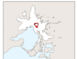
Part of Planning Scheme Map 16HO

Disclaimer This publication may be of assistance to you but the State of Victoria and its employees do not guarantee that the publication is without flaw of any kind or is wholly appropriate for your particular purposes and therefore disclaims all liability for any error, loss or other consequence which may arise from you relying on any information in this publication.