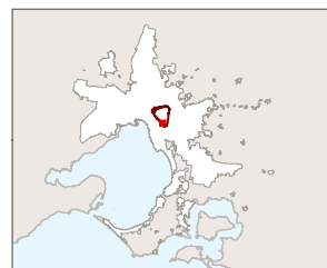
Part of Planning Scheme Map 16HO

Disclaimer This publication may be of assistance to you but the State of Victoria and its employees do not guarantee that the publication is without flaw of any kind or is wholly appropriate for your particular purposes and therefore disclaims all liability for any error, loss or other consequence which may arise from you relying on any information in this publication.