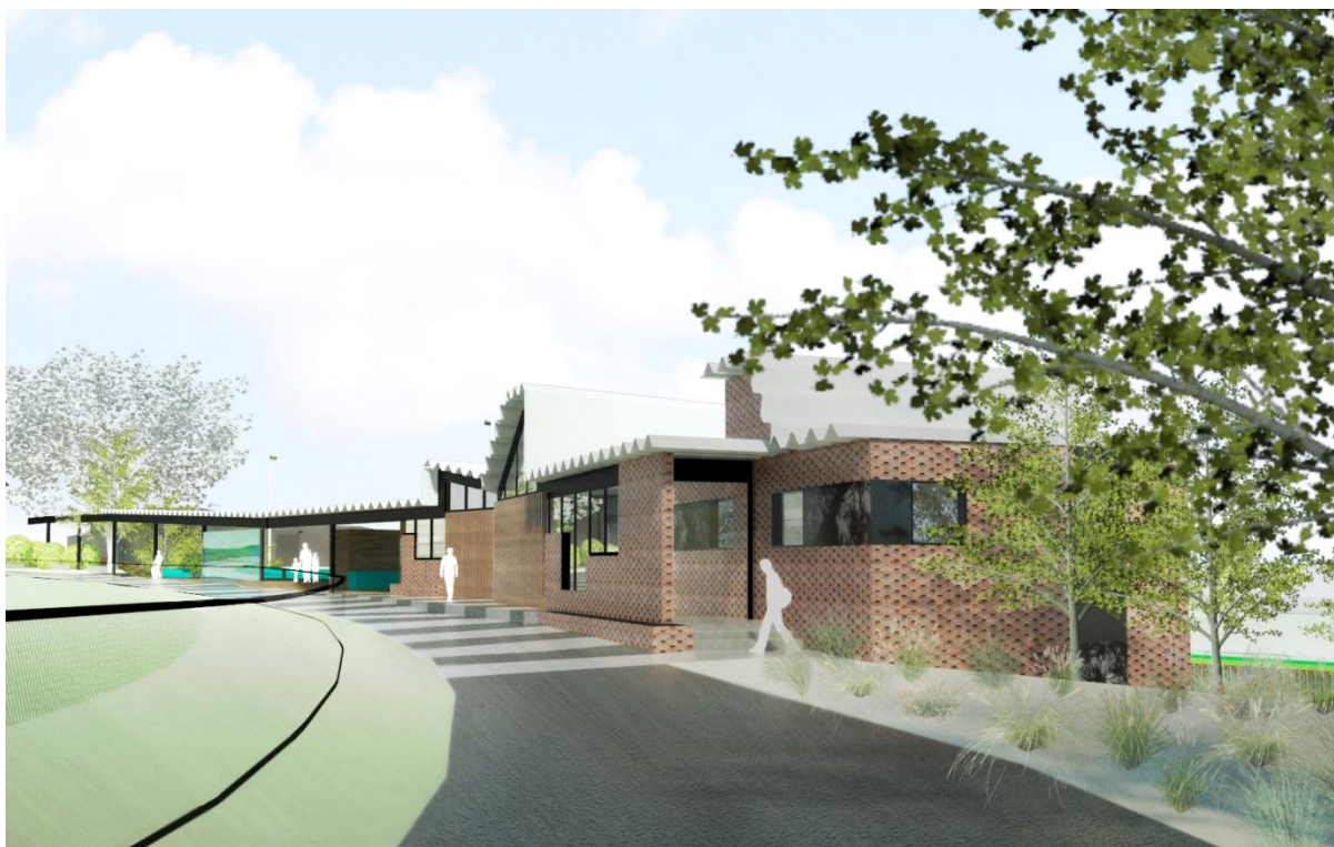
Artist's impression of the new tennis club

Site: Balwyn Park, Whitehorse Road, Balwyn