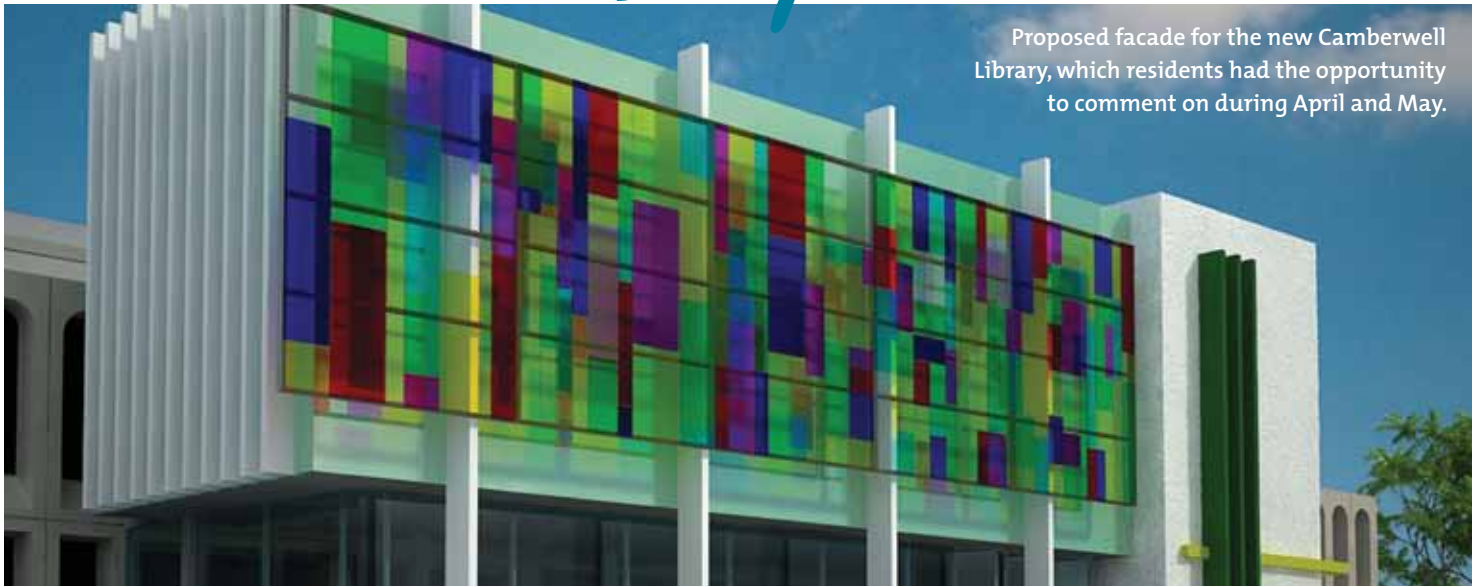
Proposed facade for the new Camberwell Library, which residents had the opportunity to comment on during April and May.

The Camberwell Centre has been chosen as the permanent home for the new Camberwell Library, and Council is continuing to involve the community at every juncture.