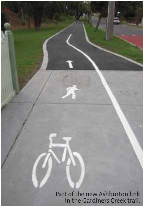
Part of the new Ashburton link in the Gardiners Creek trail.