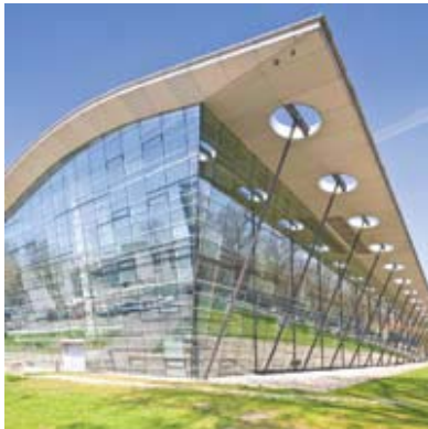
Glass and Steel

Respondents were asked to nominate the kind of architectural look and feel they would prefer for HALC. They were given an option of seven types of architecture (with photos) or could nominate their own. The most popular choice was Glass and Steel (40%), closely followed by Emphasising Stone (33%).