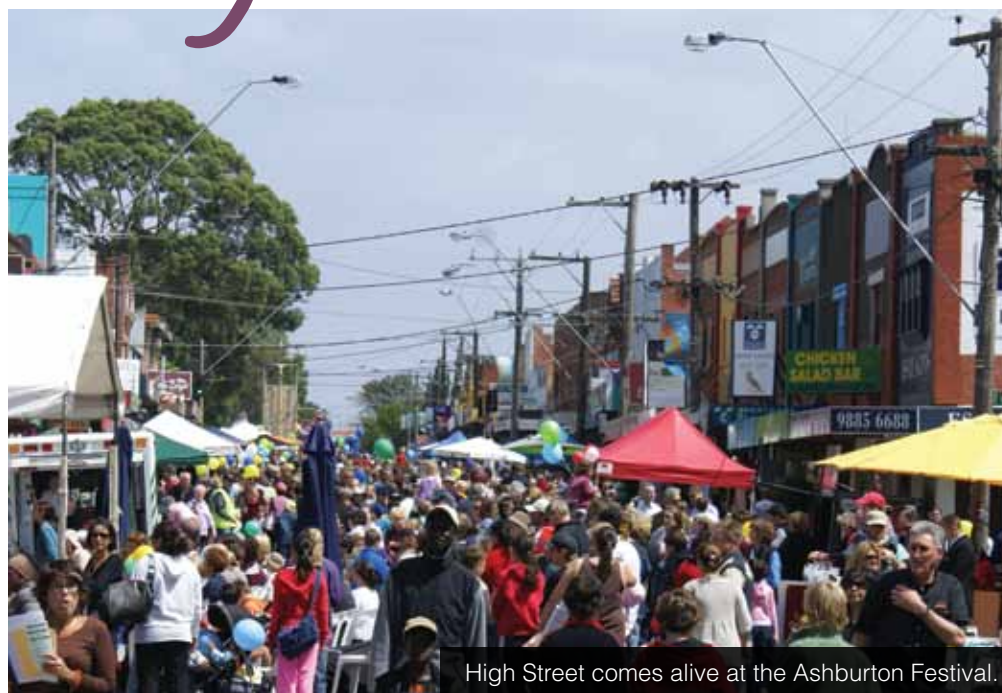
High Street comes alive at the Ashburton Festival.

Each year, the Ashburton Festival gives the the local community a day of captivating, distinctive and exciting activities, and this year's event promises to bring more of the same.