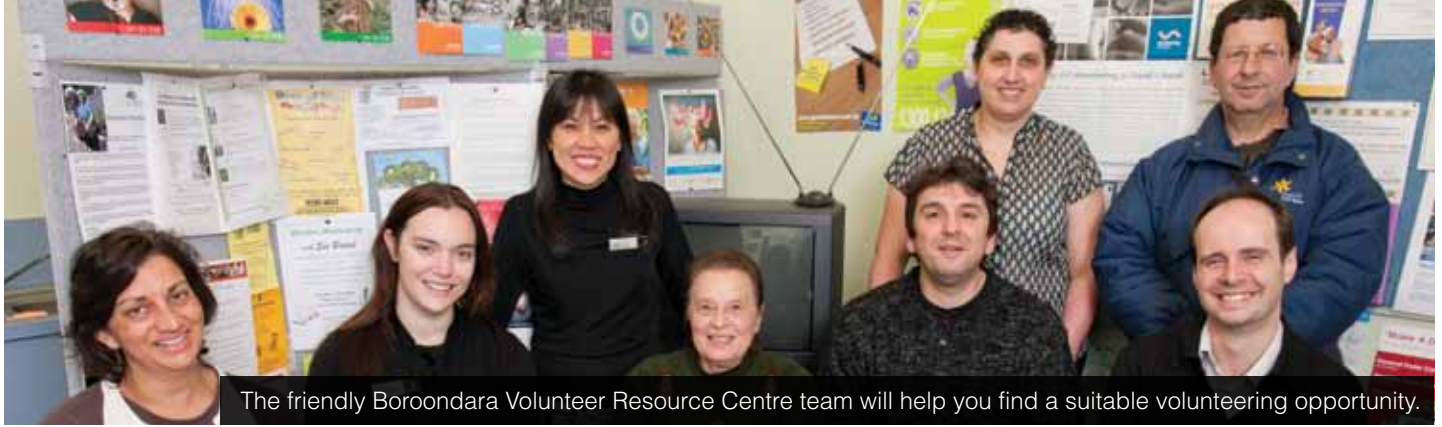
The friendly Boroondara Volunteer Resource Centre team will help you find a suitable volunteering opportunity.