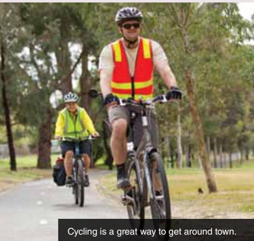
Cycling is a great way to get around town.

For more information or to book, phone 9278 4542. Morning tea will be provided at each session.