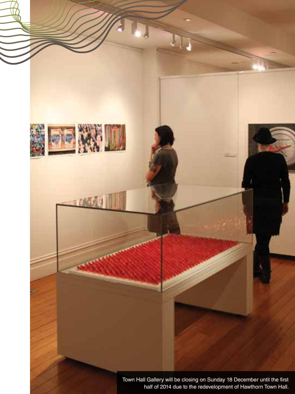
Town Hall Gallery will be closing on Sunday 18 December until the first half of 2014 due to the redevelopment of Hawthorn Town Hall.