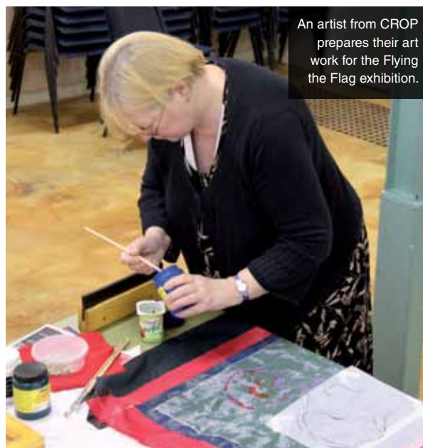
An artist from CROP prepares their art work for the Flying the Flag exhibition.