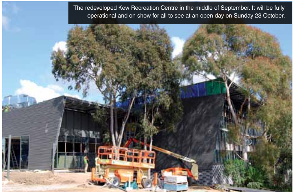
The redeveloped Kew Recreation Centre in the middle of September. It will be fully operational and on show for all to see at an open day on Sunday 23 October.