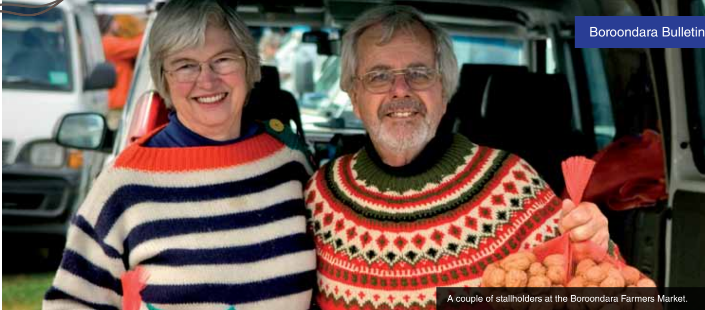
A couple of stallholders at the Boroondara Farmers Market.