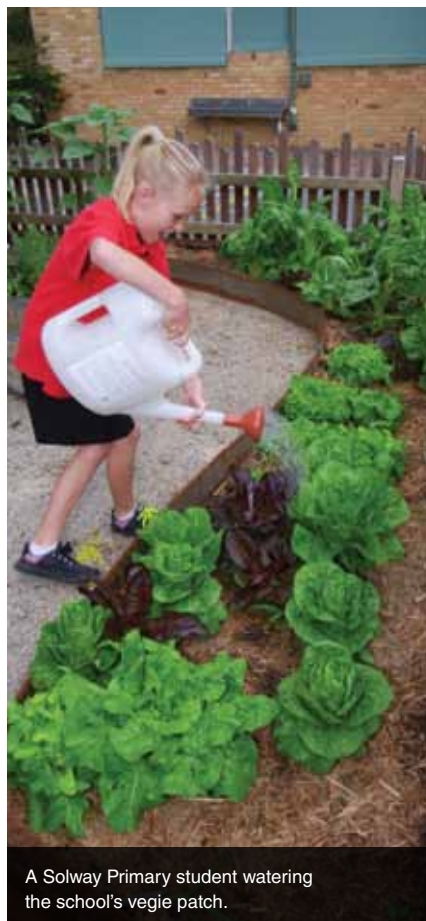
A Solway Primary student watering the school's vegie patch.

Solway Primary School will now continue on its quest to earn more green stars.