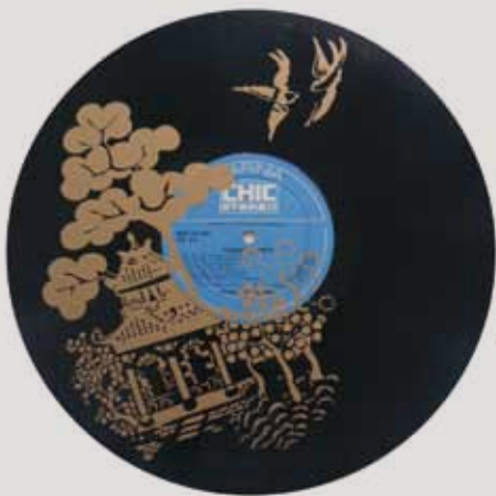
Madeleine Preston, Willow Pattern Gold Anniversary , vinyl on vinyl