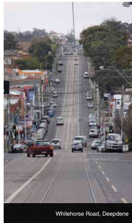
Whitehorse Road, Deepdene

For more information on Deepdene, please visit boroondara.vic.gov.au/our-city/research-statistics .