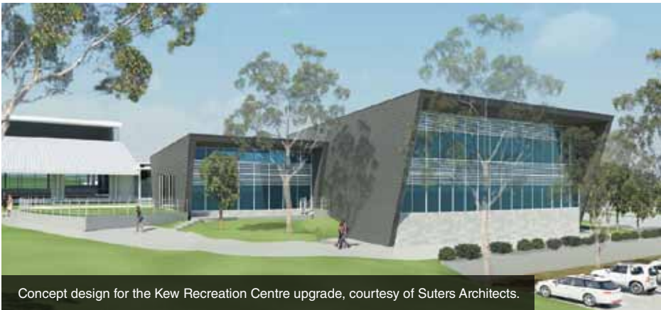
Concept design for the Kew Recreation Centre upgrade, courtesy of Sutera Architects.

For more information on the various major projects, please visit Council's website. You can also register your interest to receive project bulletins online or phone Council's Customer Service team on 9278 4444.