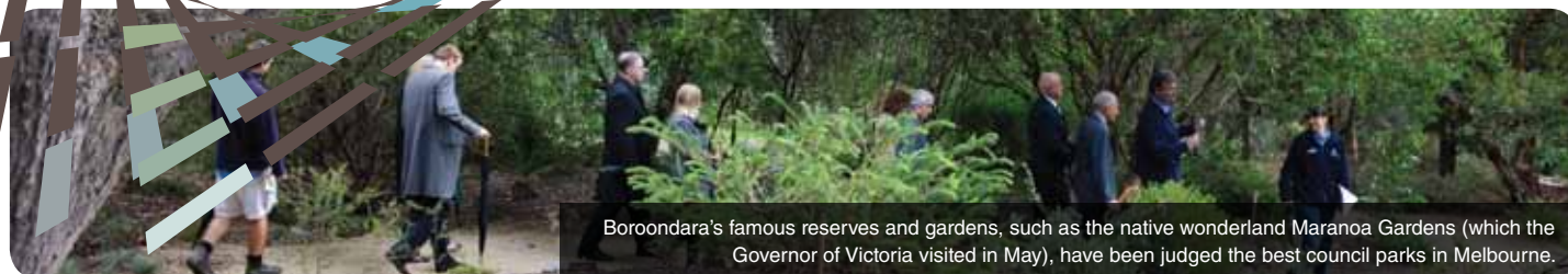
Boroondara's famous reserves and gardens, such as the native wonderland Maranoa Gardens (which the Governor of Victoria visited in May), have been judged the best council parks in Melbourne.