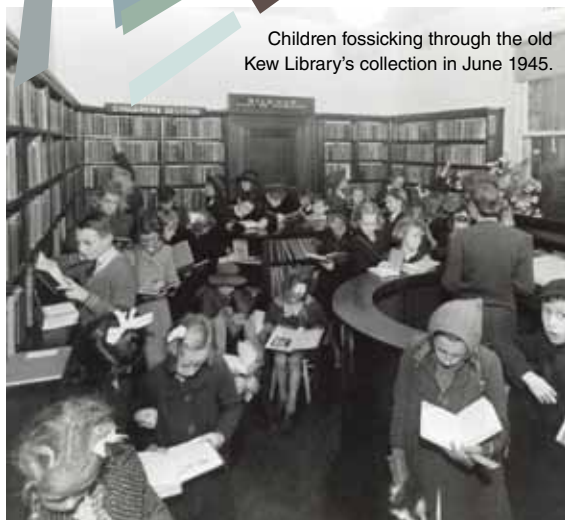
Children fossicking through the old Kew Library's collection in June 1945.