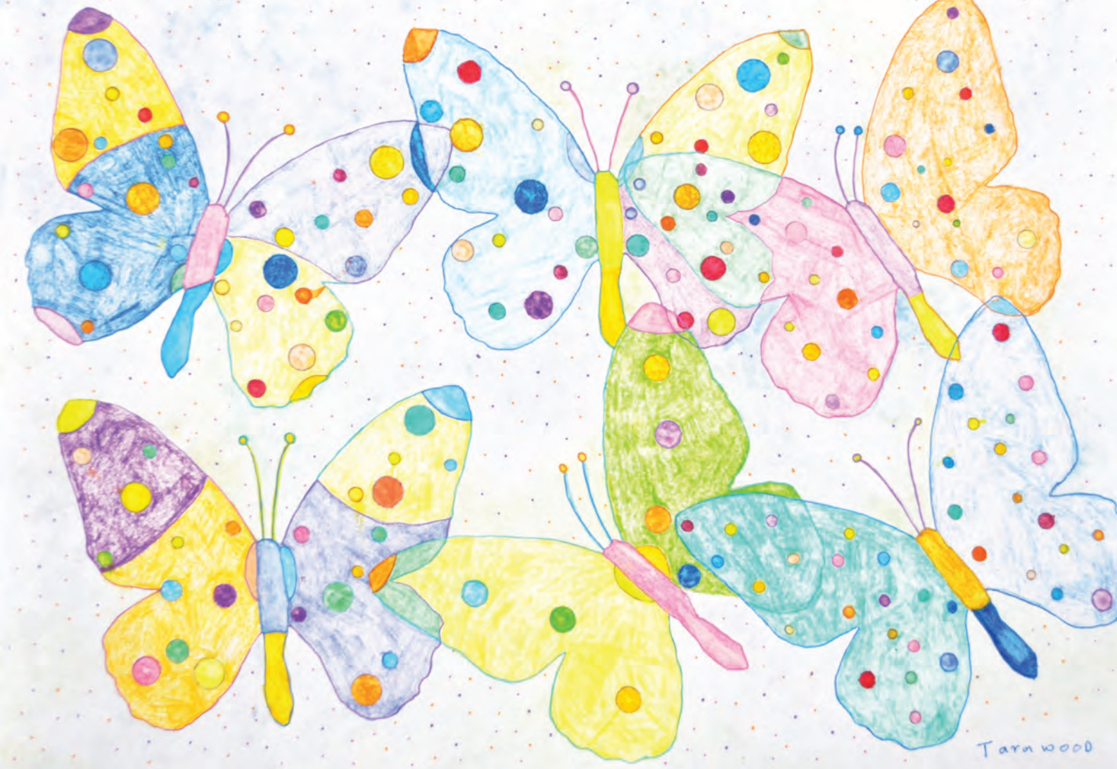
Above: Tara Wood 'Freedom to Fly' Watercolour and Pencil on Paper, 2023.