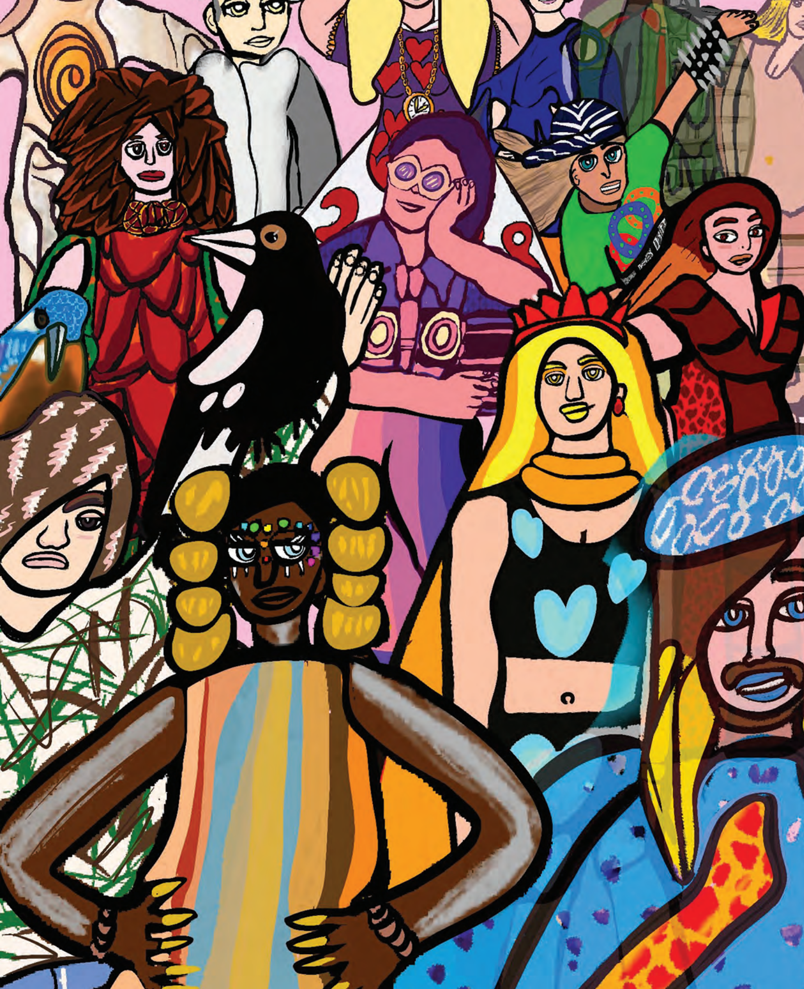
Julian Campomizzi 'All Together' Digital, 2024.