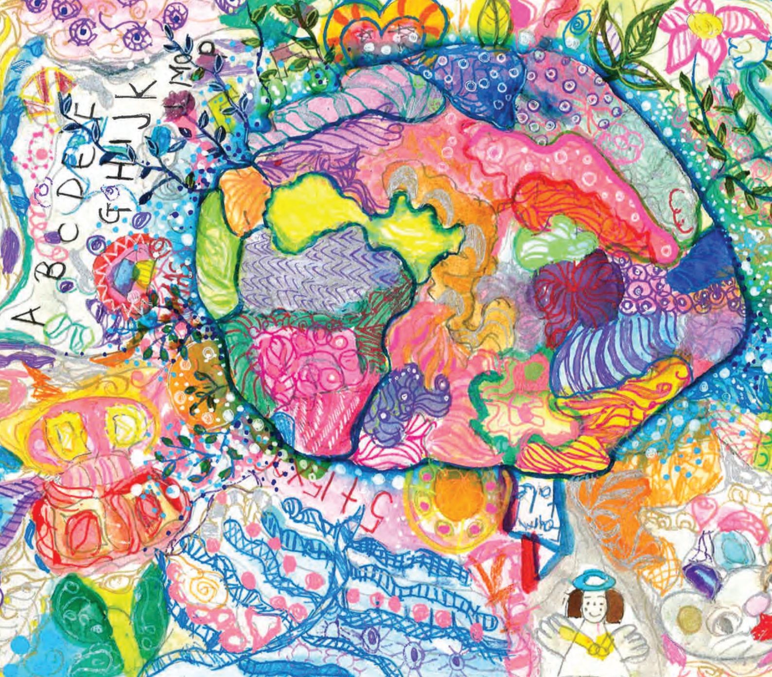
Kitty Yiu 'Flourishing Mind'