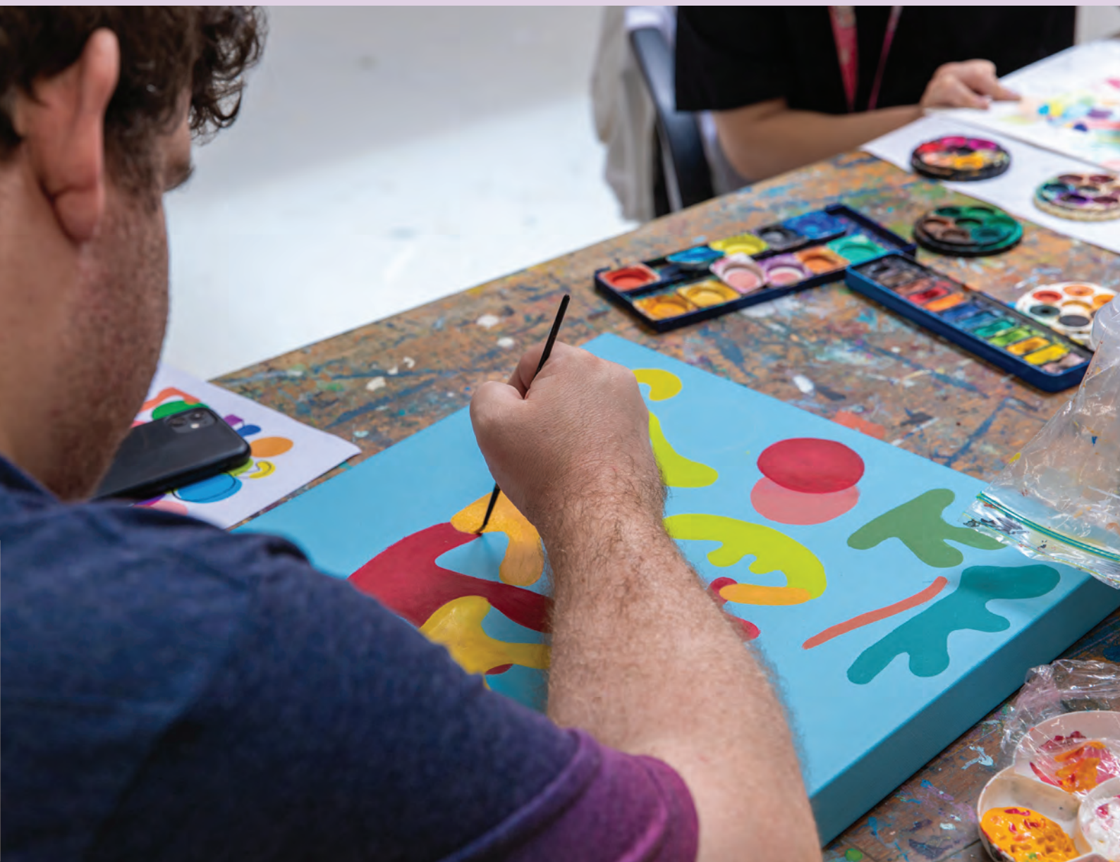
Jarrod Wendt , artist

The implementation plan includes actions Council will undertake over the first two years of the Disability Access and Inclusion Plan 2024-28. Another implementation plan will be developed for the final two years of the Plan. Operating budget and capital works budget in the implementation plan means the annual budget for the relevant teams will cover the activity. It does not require additional project funding or funding from other sources. Grant opportunities may be sought for actions 2 and 13 to enhance what can be delivered.