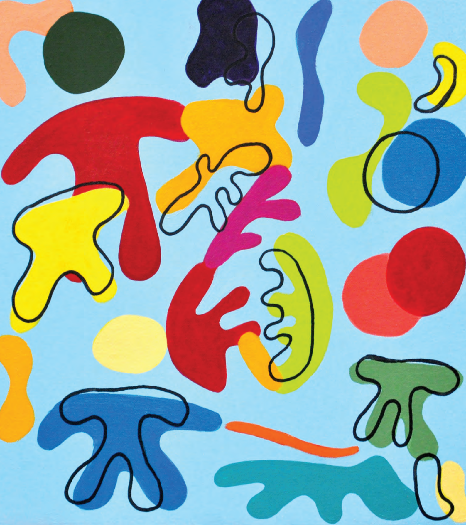
Jarrod Wendt 'Equality in Community' Acrylic, 2024.