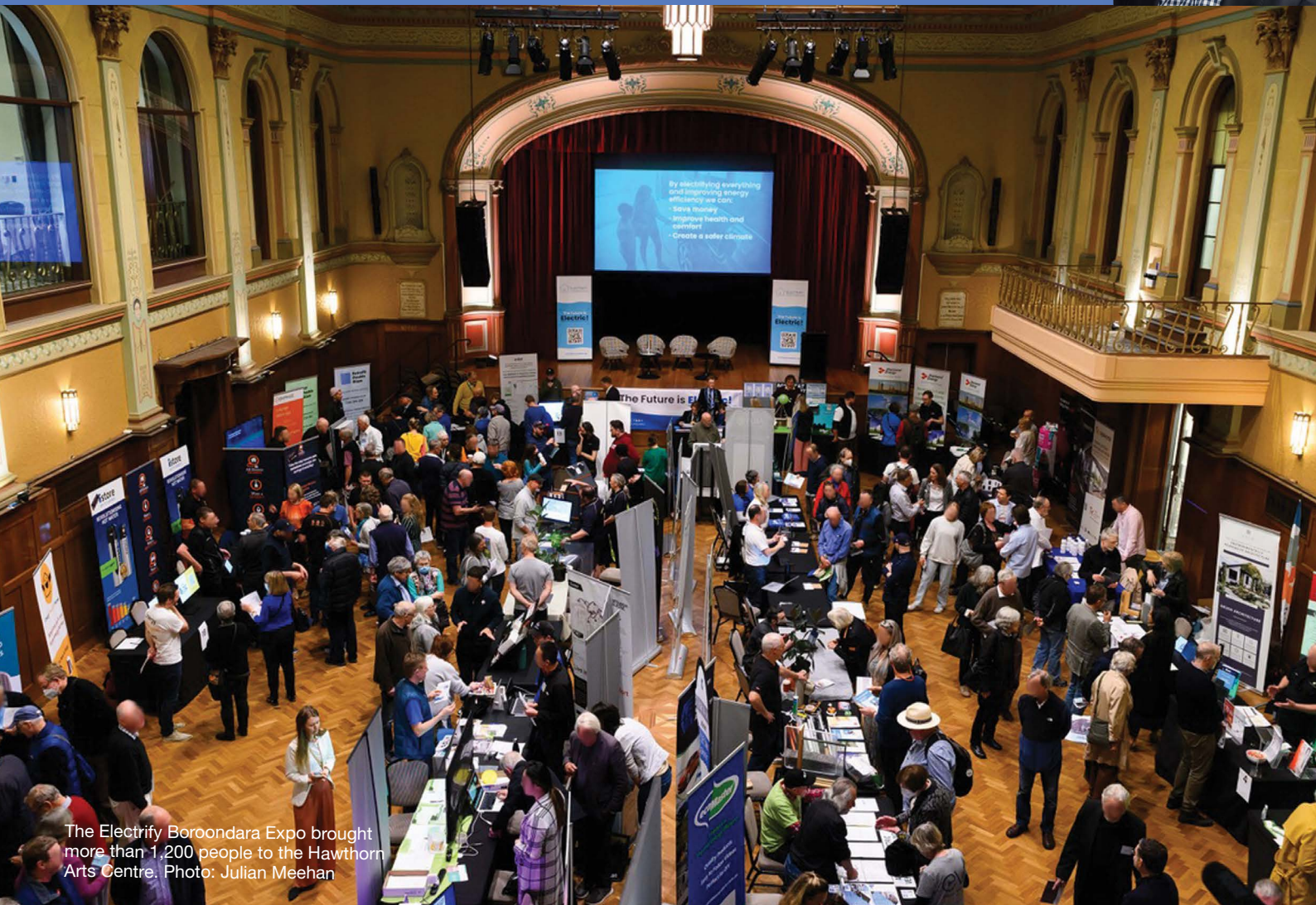
The Electrify Boroondara Expo brought more than 1,200 people to the Hawthorn Arts Centre.